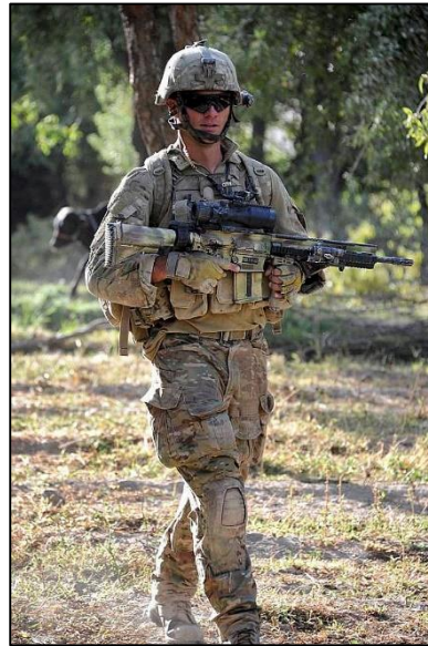
A 2RAR MTF-3 soldier from A Coy on patrol. The Afghan National Army (ANA) led and MTF-3 supported clearance operation was conducted in the Mirabad Valley.

2RAR initially received a Kiwi company from Malaya and then a further Kiwi Company a few months later and became the first of the ANZAC Battalions serving in South Vietnam. The Battalion returned home in mid-1968 and relocated to Townsville and went back to South Vietnam in 1970 still as the ANZAC Battalion. The Battalion returned home the following year.